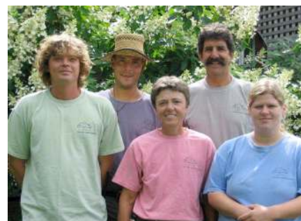
The staff at Cobble Creek Nursery